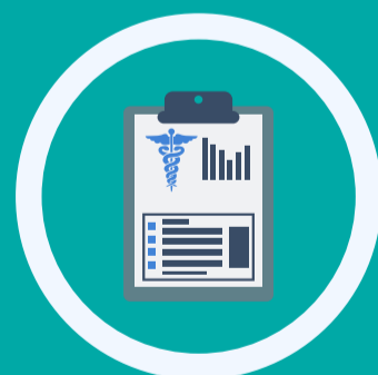
Post-anesthesia care, teaching and discharge planning

For more information on Certified Clinical Anesthesia Assistants and the important roles they play on anesthesia care teams, contact the CSRT.