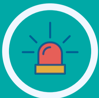
Perioperative crisis management and resuscitation