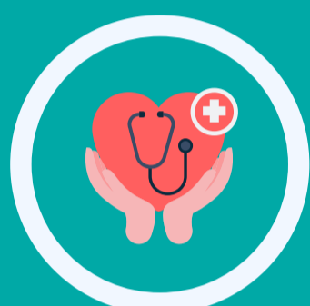
Preoperative assessment and care

Roles Certified Clinical Anesthesia Assistants perform under the medical direction of an anesthesia specialist physician include: