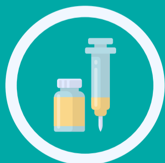
Procedural sedation delivery and monitoring