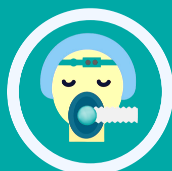
Assistance with induction, maintenance and emergence