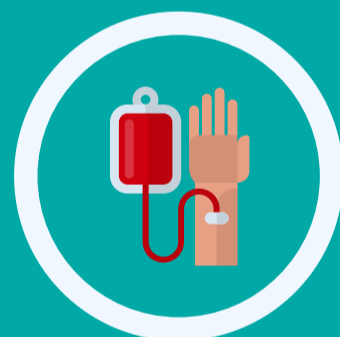
Vascular access, fluid and blood replacement