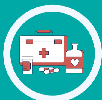
Administration and titration of anesthesia agents