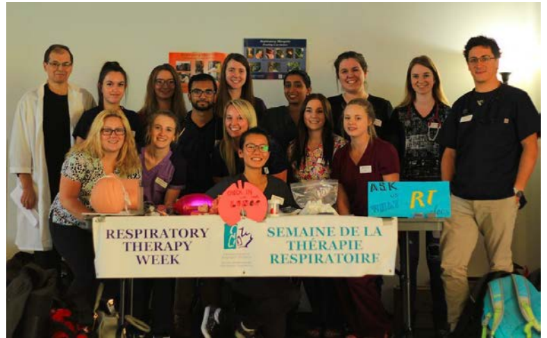
Published on Instagram by @ceciliawang3003 (Canadore College, North Bay, ON)